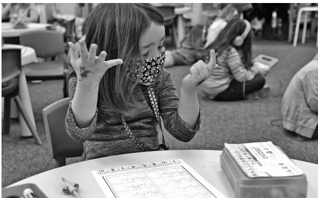
Edgar Road kindergartner works on counting.

Please call the Student Services office if you have questions at 961-1233.