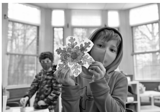
Clark kindergartners are working on winter activities.

Earlier this month, Standard & Poor’s issued the district an AA+ rating, making WGSD one of the highest rated districts in the state. Only one other K-12 district has that rating; four districts have a higher rating. In the credit overview S & P stated, “The district’s track record of robust financial performance and strong management practices position it well to maintain its stable credit profile over the next two years.”