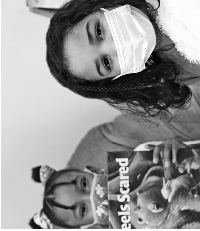
Kindergartners at Bristol share a book.

terminated, a copy of the parents' Decree of Dissolution of Marriage or the other Court Order terminating parental rights.