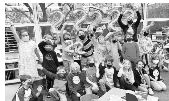
Second graders at Edgar Road took part in the “twos” celebrations.